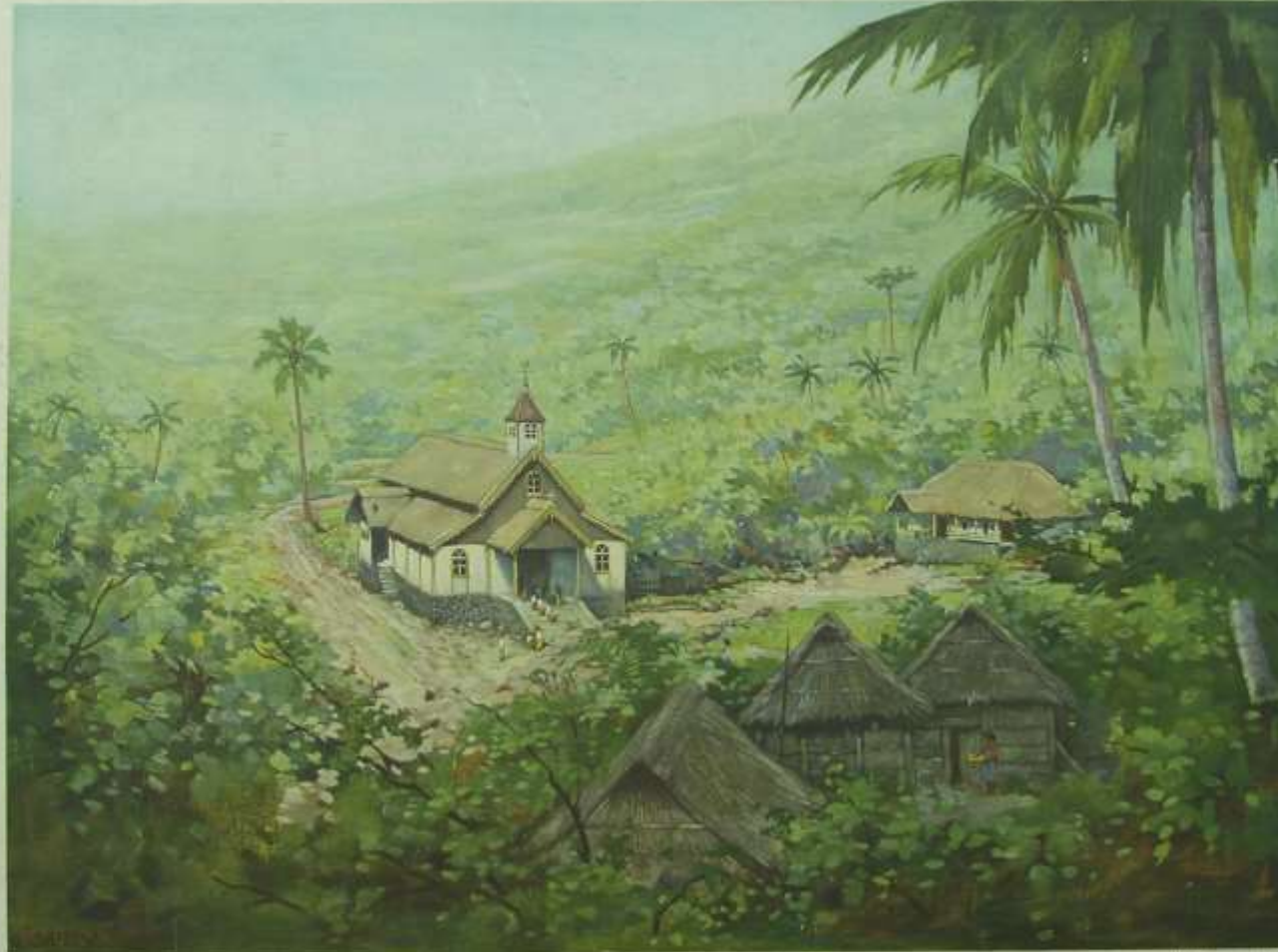
De Missie in Insulinde. Kerk op Lomblem. Kleur Swaigelanden.