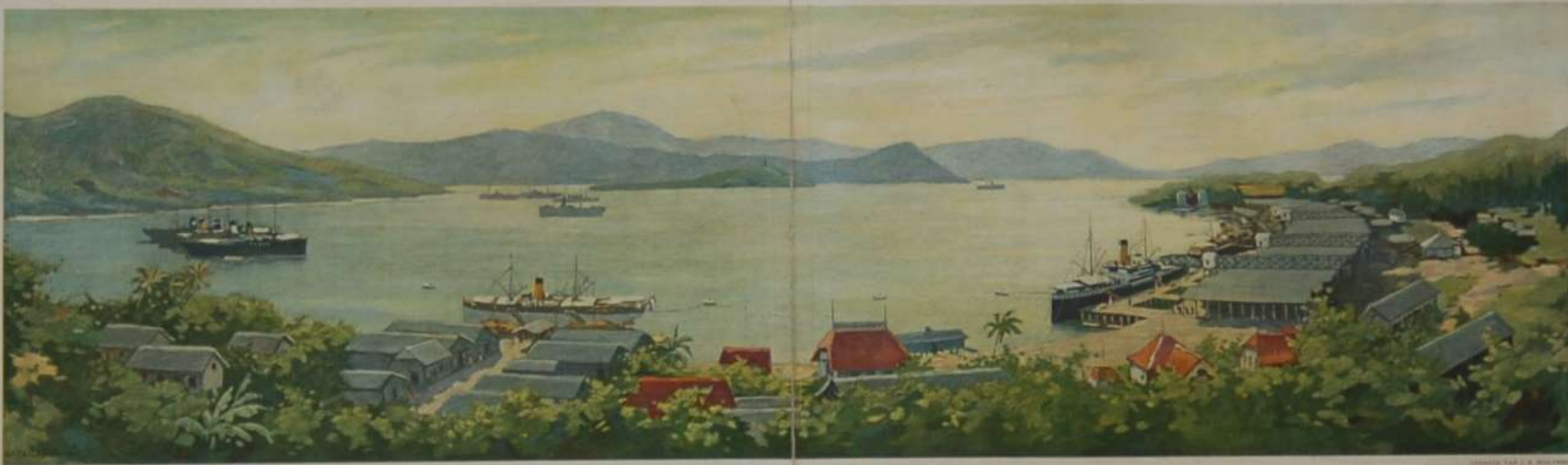
De Sabanghaven op Poeloe Weh. Sumatra.

Selling the “Ethical” Colonial Policy for the East Indies to Dutch Schoolchildren (around 1900)