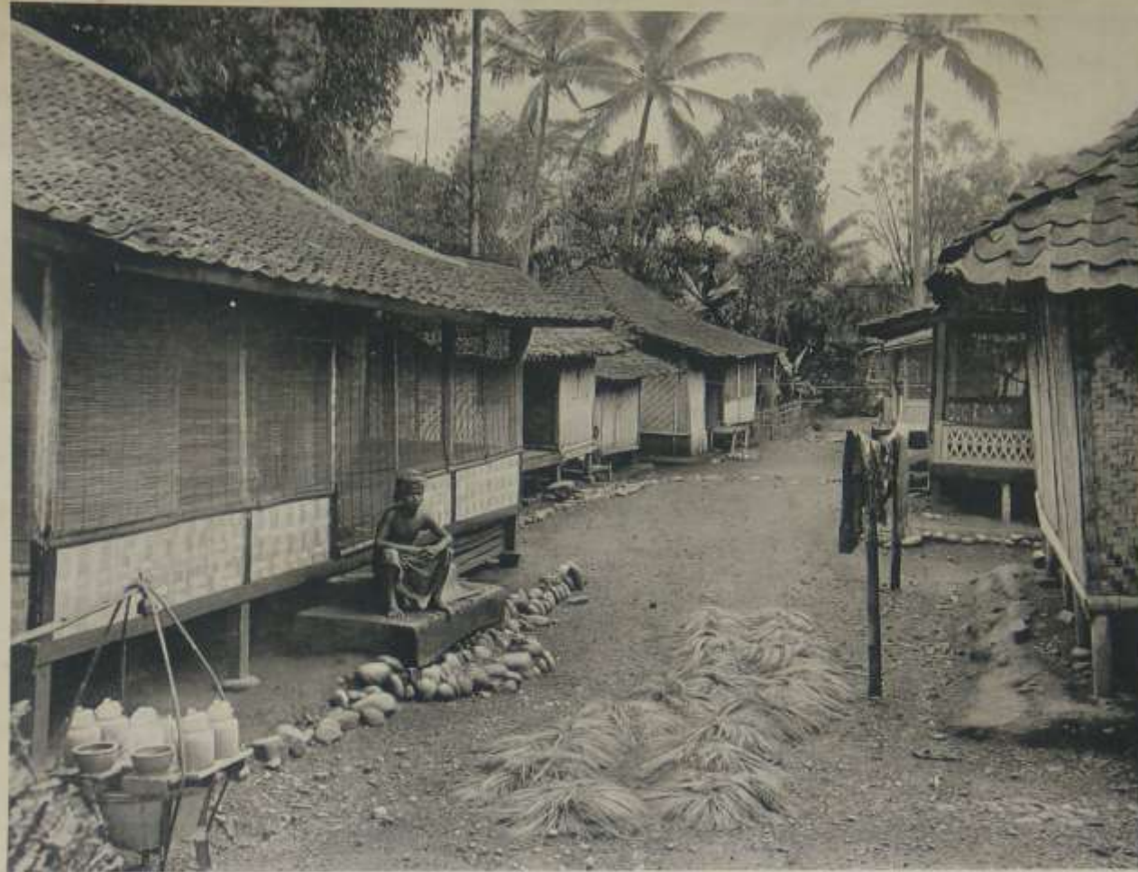
110. Een Kampong van Garoet.